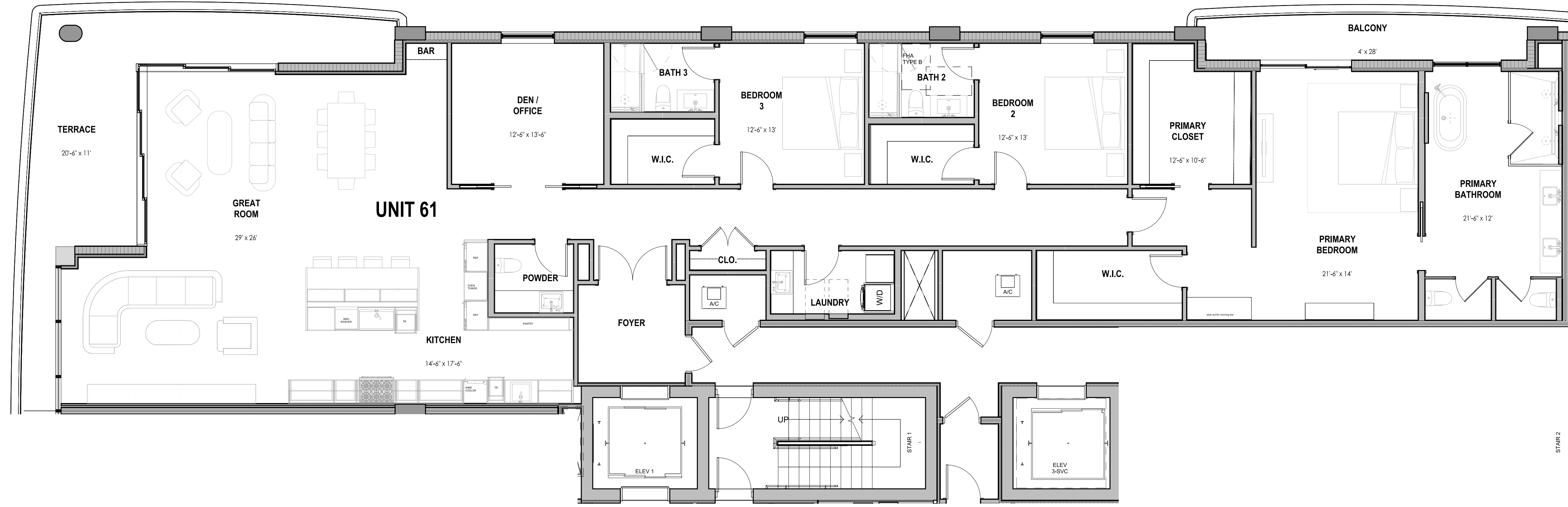
UNIT 61 - TYP. FLOOR (6TH -9TH) 1 3/16" = 1'-0" A-4.06.1-3