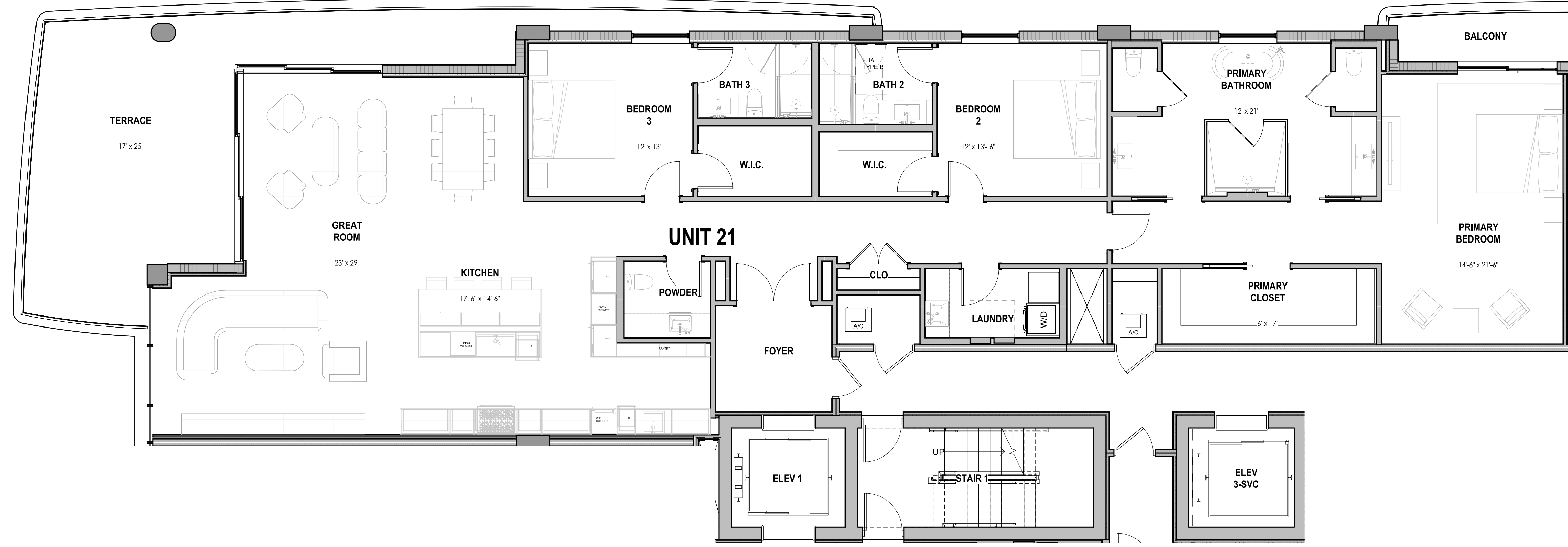
UNIT 21 - TYP. FLOORS (2ND -5TH) 1 3/16" = 1'-0" A-4.02.1-3